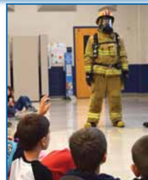
Londonderry Twp. and Hummelstown volunteer firefighters speak to elementary students.