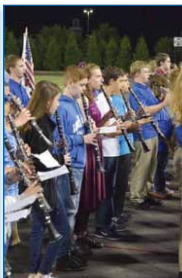
Band students in grades 5-12 performed together in the annual Mass Band Night.